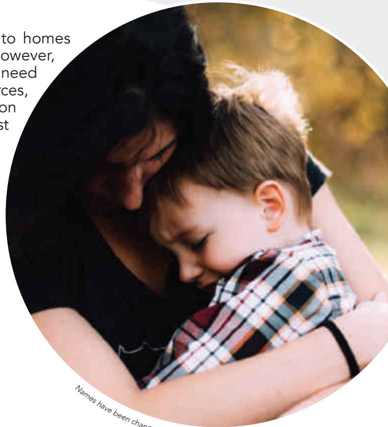
Names have been changed and photo is for illustration only

IFS case managers are on the front lines going into homes putting themselves and their own families at risk. However, more than ever, our client families need us. They need our support, consistency, encouragement, resources, and prayers. Our IFS staff continues to rely on God's strength and provision in service of our most vulnerable families.