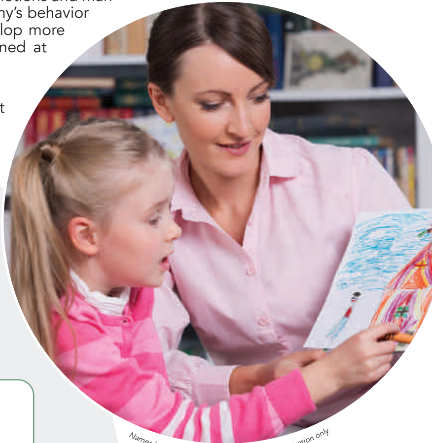
Names have been changed and photo is for illustration only