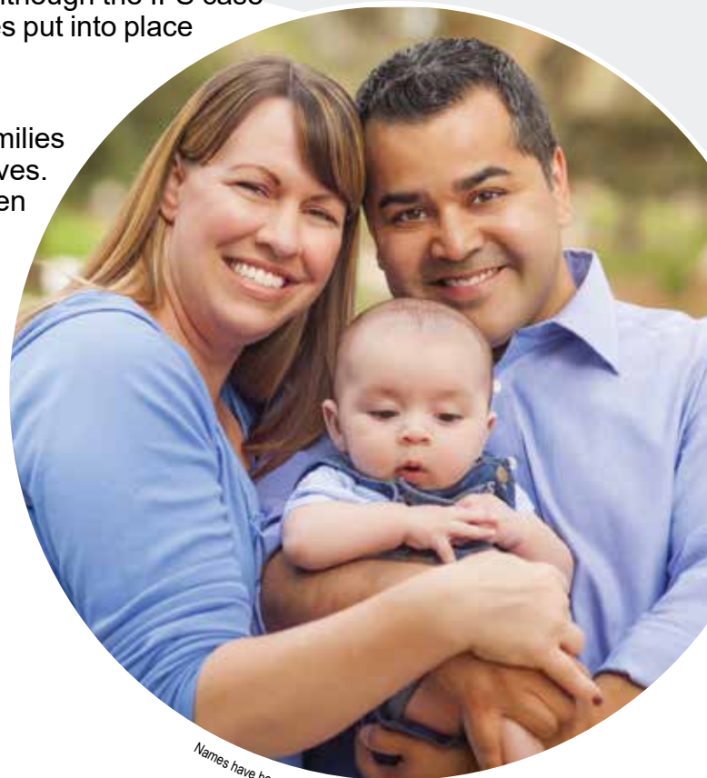
Names have been changed and photo is for illustration only

It is an incredible privilege to come alongside families when they are struggling with challenges in their lives. We are encouraged to see positive changes when families are strengthened and remain together.